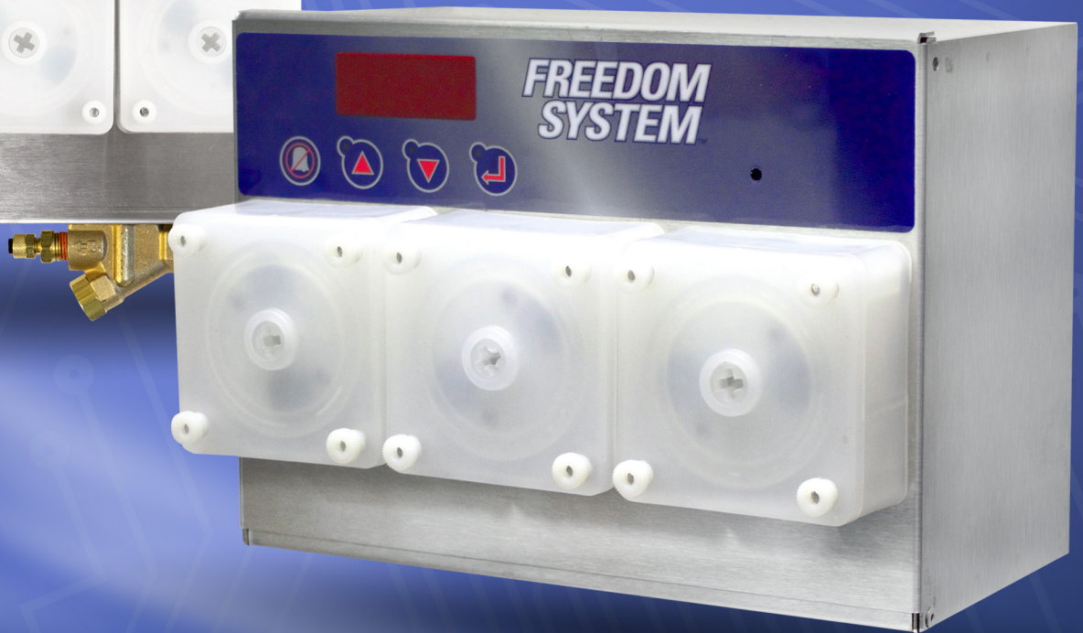
Freedom System L3