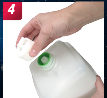
4 TO REMOVE: Unscrew the white ring and move side to side to release.