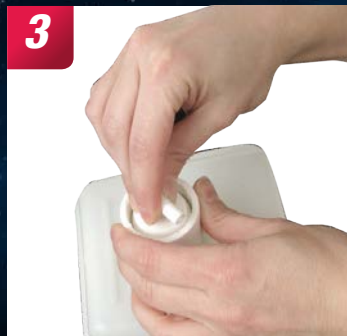
3 While pushing down, screw the cap tight. Position the barb towards its connection tubing.