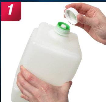
1 Remove shipping cap from product.