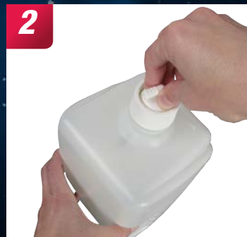
2 Position the delivery cap onto the product and push down firmly in the center.