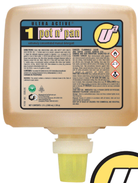
pot n' pan

Makes 1530 In-Use Gallons #064868 - 2/1500 mL case