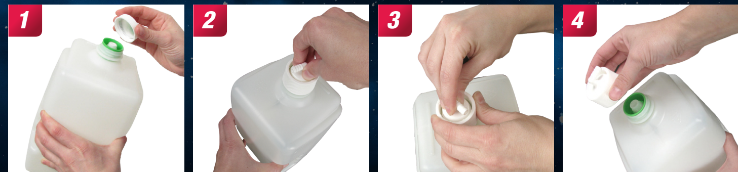
1 Remove shipping cap from product. 2 Position the delivery cap onto the product and push down firmly in the center. 3 While pushing down, screw the cap tight. Position the barb towards its connection tubing. 4 TO REMOVE: Unscrew the white ring and move side to side to release.