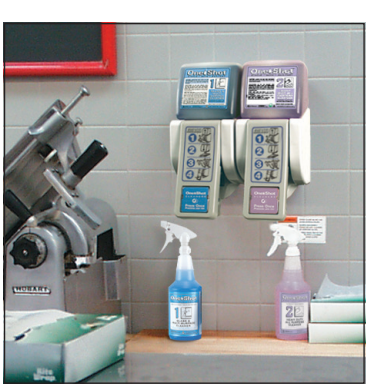
Grocery / Retail