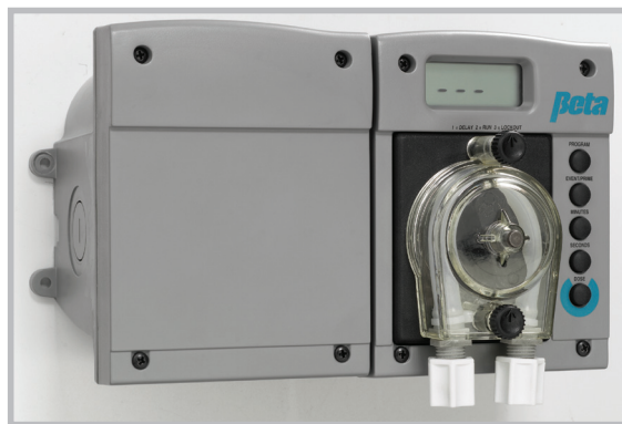
For installations where line power is not accessible, SingleShot is available with a convenient battery pack.