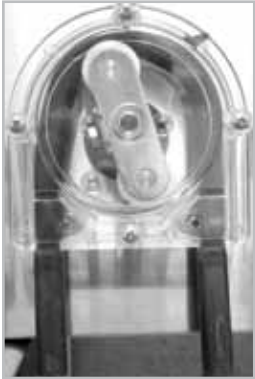
2000 Series Pump