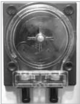
600 Series Pump